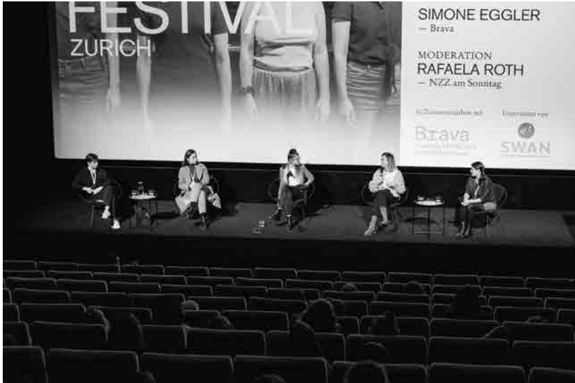
Panellists after the film