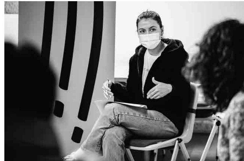
refugee women during an exchange, December 2021